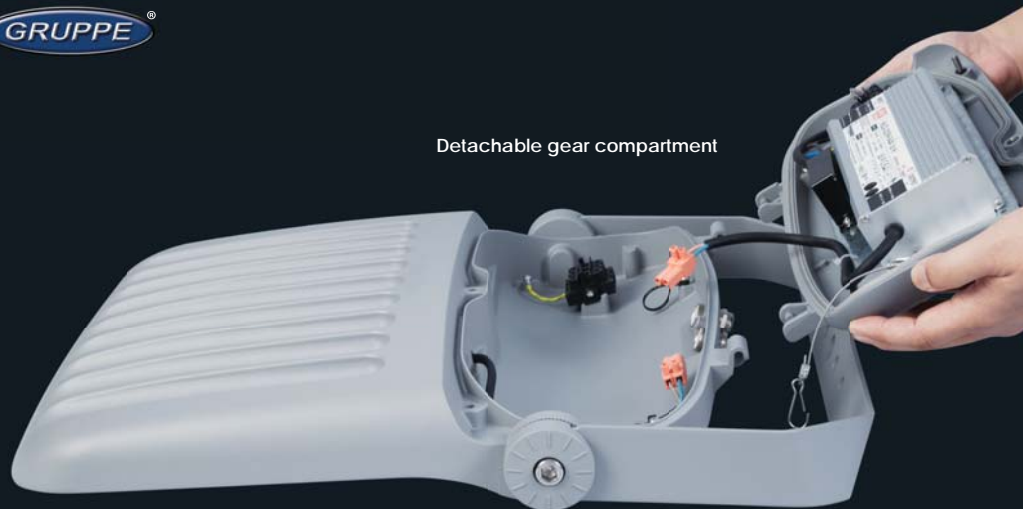
Detachable gear compartment