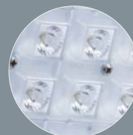
High Power LED