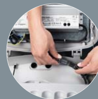
Easy Maintenance Plug & Play