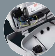
Safety Knife Switch